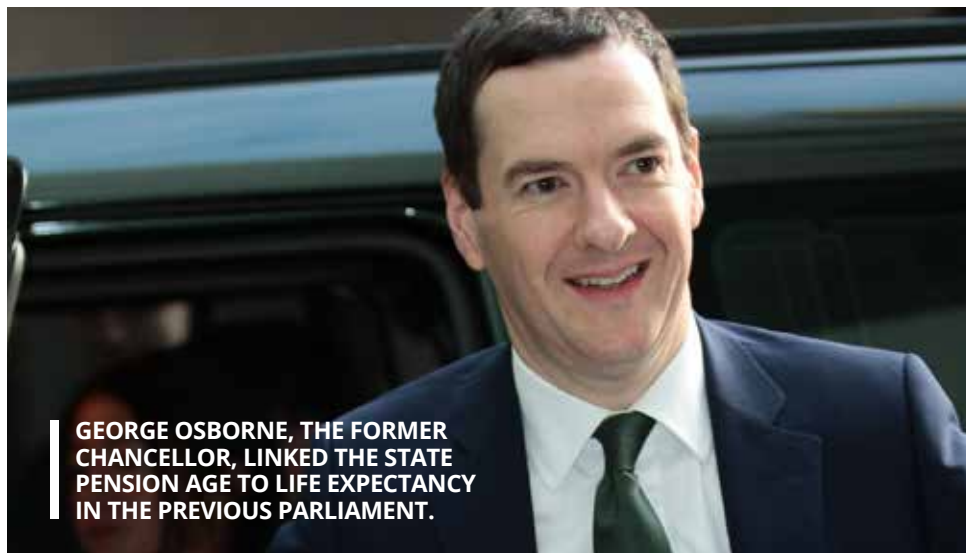
GEORGE OSBORNE, THE FORMER CHANCELLOR, LINKED THE STATE PENSION AGE TO LIFE EXPECTANCY IN THE PREVIOUS PARLIAMENT.

Planning to prevent the financial equivalent of climate change