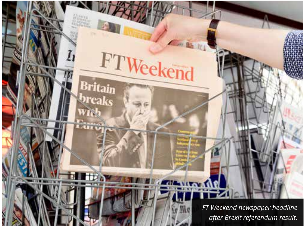
FT Weekend newspaper headline after Brexit referendum result.

Looking towards the future, diversification will help protect investments from the full impact of market volatility, but it's important that investors don't over-worry about disruptive events or financial crises that are unlikely to happen and play it too safe in their asset allocation.